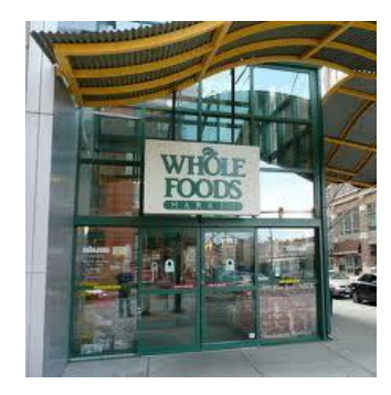
Harbor East (Maryland) Wholefoods location in Baltimore