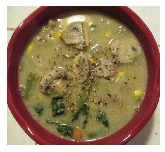
Soup with veggies that has lots of mushrooms is great for fighting a cold.

Janice: Soup is my go-to favorite, regardless of season. You can combine so many wonderful ingredients---beans, veggies, herbs, spices, potatoes, whole grains, and more---in endless taste and texture variations. Soup is also very forgiving to cook, and there are thousands of great recipes easily found. Just leave out the oil if the recipe calls for it; you can sauté your veggies initially in a little water or broth.